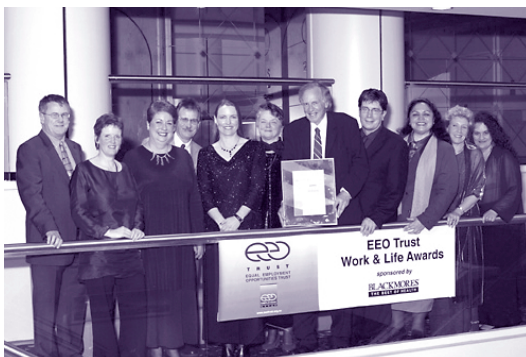
Winner of the Large Organisation category was the Auckland University of Technology

The Prime Minister presented the EEO Trust Work & Life Awards 2002 at an event attended by 320 guests. The awards attracted 26 entries, with a record number of entries in the small and medium sized organisation category. Entrants reported that the process of entering the awards was a positive one enabling them to benchmark their progress and communicate it throughout their workplaces.